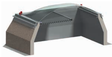
Sectional view of a fixed dome rooflight with solar shadowing