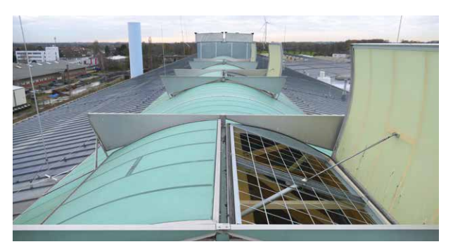
GRILLODUR® DSG in a double flap

With the appropriate certification in accordance with GS-BAU-18, the GRILLODUR® DSG fall-through protection is able to fulfil the high requirements of the employer's liability insurance association for the construction industry.