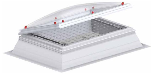
JET LK-DDN, installed on a GRP upstand with dome rooflight, ventable