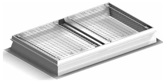
JET LK-DDN for SHEV dome rooflight